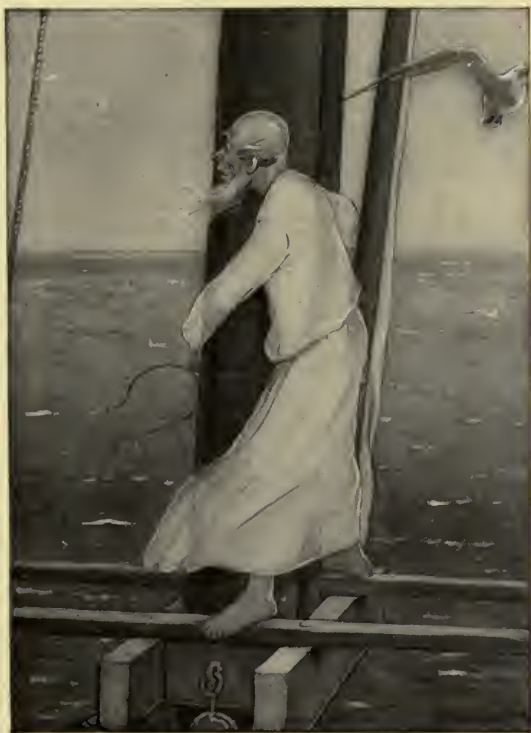
SHEM IN THE LOOKOUT